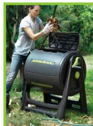
Tumbling Compost Bins