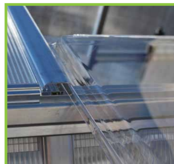
Sliding panel assembly system - panels will not pop out