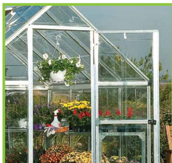
Hinged door can be assembled either left or right side