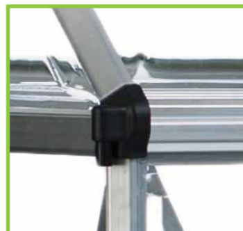
Unique gutter system allows you to harvest your own rainwater.