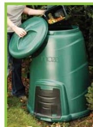
Freestanding Compost Bins