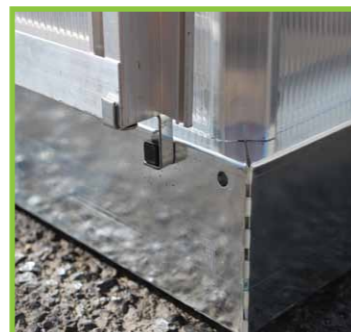
Magnetic door catch