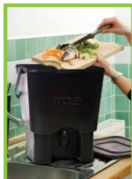
Bokashi Indoor Composter