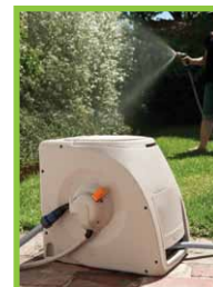
Automatic Hose Reels